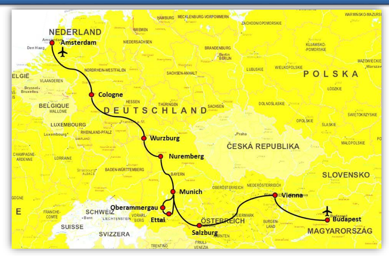
Day 6 - Salzburg

Breakfast, High-speed Rail from Munich to Salzburg, 4-hour Sound of Music tour (pick-up from your hotel included), in the evening free time for sightseeing in Salzburg (ticket for free use of the public bus lines within the city – provided by the operator of the Sound of Music tour), Accommodation in Salzburg