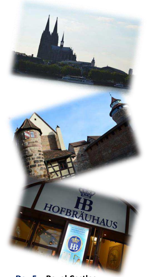
Day 5 – Royal Castles

Breakfast, High-speed Rail from Nuremberg to Munich, Munich All Day Pass, free time for sightseeing in Munich, Munich Residence, Treasury at the Residence, Cuvilliés Theatre, Nymphenburg Palace and Park, Hall of Fame and Statue of Bavaria (admission covered by your "admission card"), Accommodation in Munich