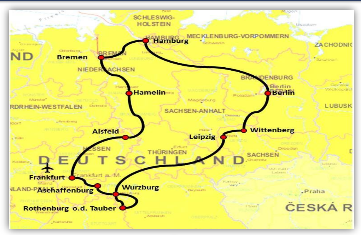
Day 6 - Hamburg and Bremen

Breakfast , Drive from Berlin to Hamburg, free time for sightseeing in Hamburg, drive on to Bremen, Accommodation in Bremen